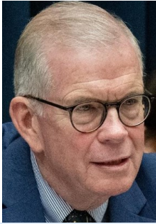
Congressman Tim Walberg (MI-5)

The Honorable Tim Walberg, U.S. House of Representatives, Congressman from Michigan's 5th District