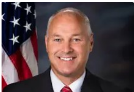
Congressman Pete Stauber (MN-8)